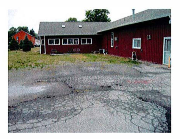
Village Hall Building & Rear side view showing need for parking improvements.