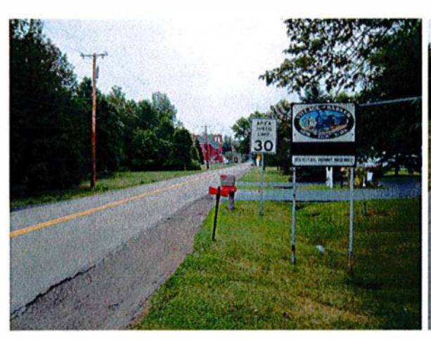
Views of Coleman Road — County Highway.