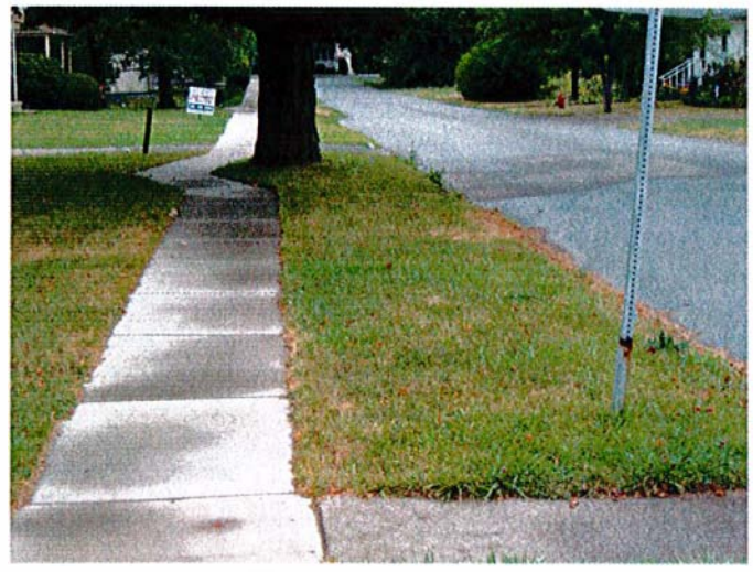
New Sidewalk on South side of Church St. / Yard drain on Church St near Quaker St.