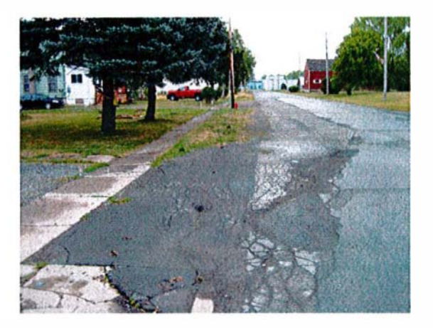
North side of Main Street near Pallister showing broken, uneven pavement sections, lack of curbing and insufficient drainage.