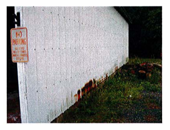
Salt storage facility in need of rehabilitation