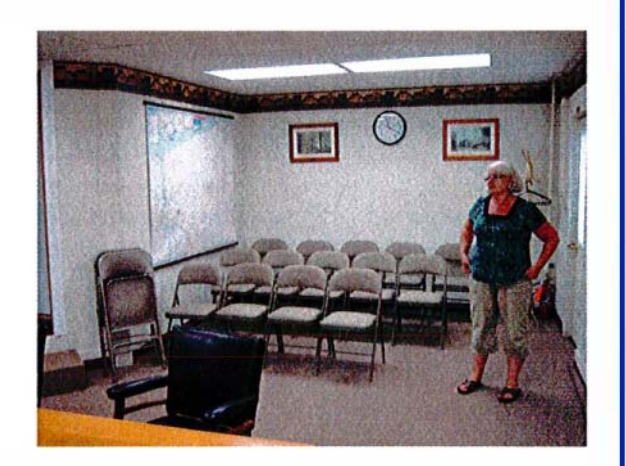
Village Clerk's office area & Village Board Meeting Room, with both areas refurbished by Village staff.