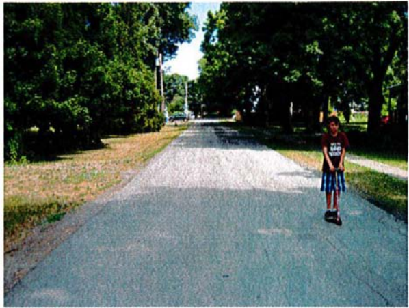
Woodward Avenue viewing westerly from Quaker, and easterly from deadend.