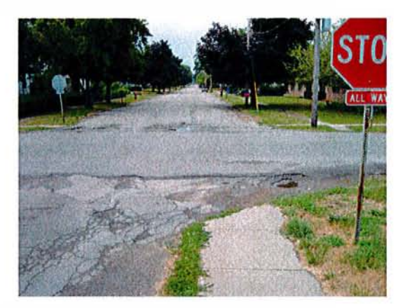
Pallister Avenue near Church Street

Pallister Avenue between Church and Coleman / Poorly situated CB in front of Funeral Home.