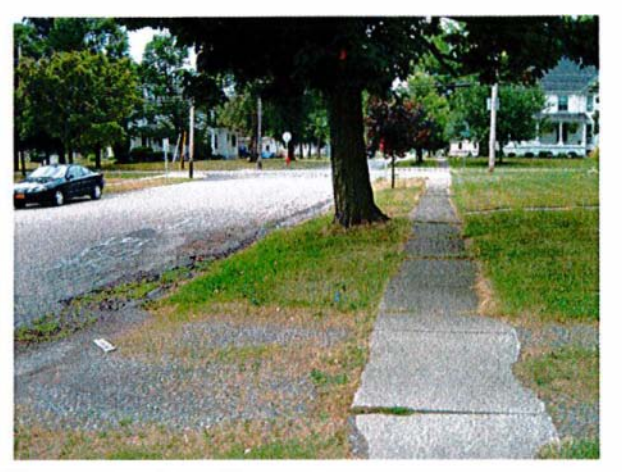
Pallister Avenue between Church and Coleman.