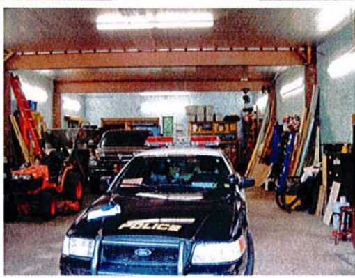
DPW's Maintenance Garage & Auxiliary Equipment Building