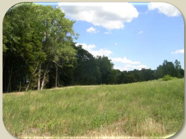
Dussault Foundry Site, City of Lockport